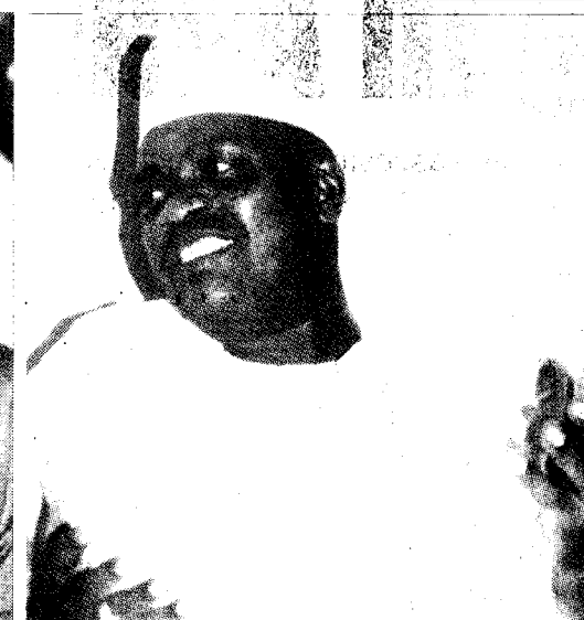
• Governor Danjuma Goje