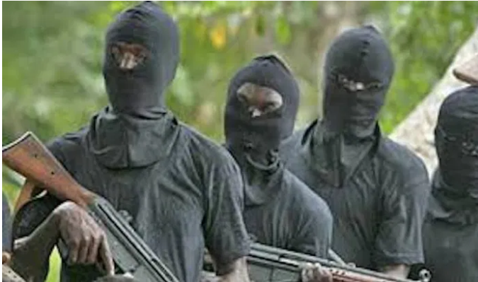
Francis Sardauna in Katsina

Suspected bandits yesterday killed 11 people and kidnapped five others in fresh attacks on Ungwar Sarki and Sharu villages in Faskari Local Government Area of Katsina State.