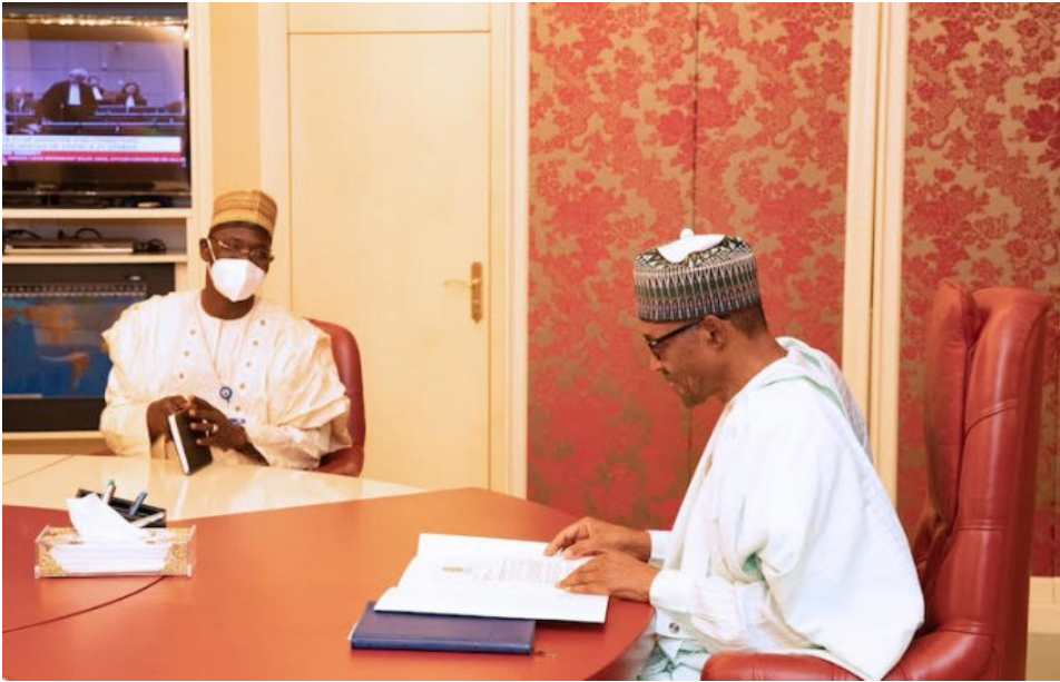
PRESIDENT BUHARI RECEIVES NASARAWA GOV ENGR ABDULLAHI SULE 1A&B. President Muhammadu Buhari and Nasarawa State Governor Engr Abdullahi Sule during an audience with the President at the State House Abuja. AUGUST 18 2020.