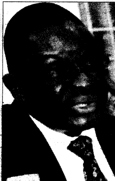
Senator Gyang Dantong