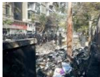
Egyptian Protesters in New Clashes With Security Forces