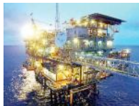
Nigeria to Renew Foreign Company Oil Leases?