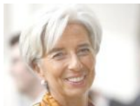
Manage Resources Better, IMF Chief Tells Africa