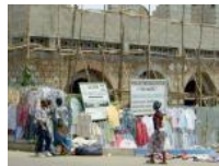
New IMF Chief Visits Africa to Promote Growth