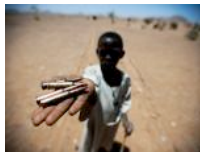
Great Lakes Leaders Call for Action On Darfur Rebels