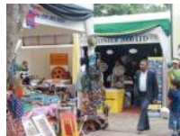
Renewed Impetus to Africa's Economic Growth