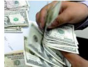
Kenyan Economic Growth Threatened by Inflation - Agency