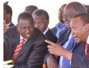
Ten Kenyan Ministers Named On New Impunity List

Explosion Rocks United Nations Abuja Office Lawyers in Free-for-All Over Constitution Amendment Deadly Bomb Blast Hits UN Office