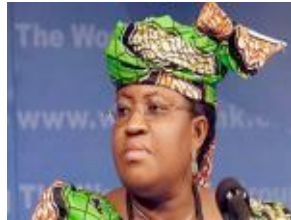
How Will New Finance Minister Manage Nigeria's Debt?