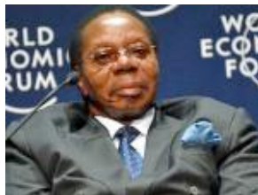
Malawian President Declares 'War' on Critics