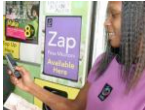
'Fake Handsets' Subscribers to Be Switched Off