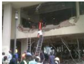
Deadly Blast Hits UN Building in Nigeria