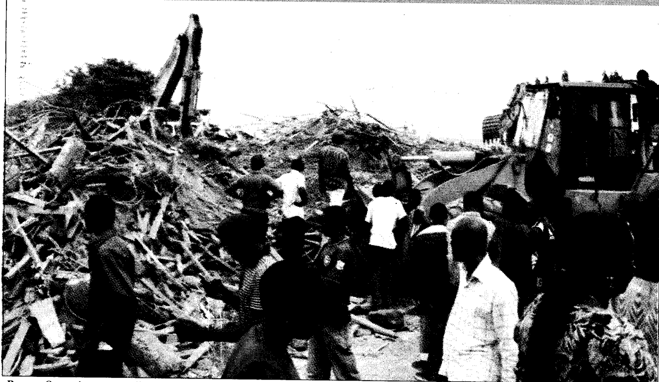
•Rescue Operations at a collapsed building site in Abuja ...yesterday