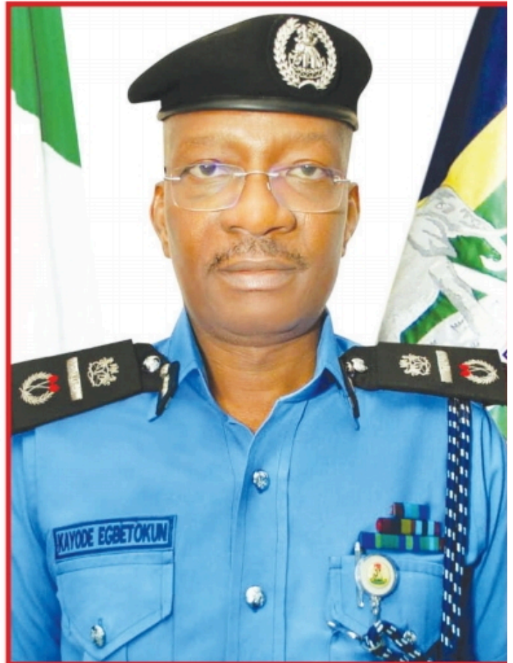
IGP Kayode Egbetokun