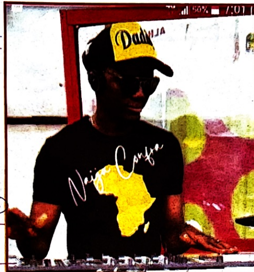
One of the cultist killed in Ojo