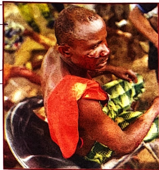
One of the victims