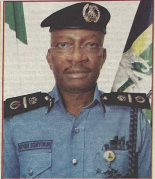
IGP Kayode Egbetokun