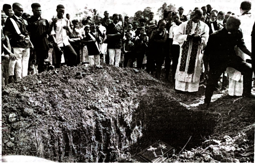
At the burial

The attires, which included the Brigade cap, shoes, clothes and other materials were later handed to his father by the Brigade at the graveside in accordance with the organization's tradition before the casket was lowered