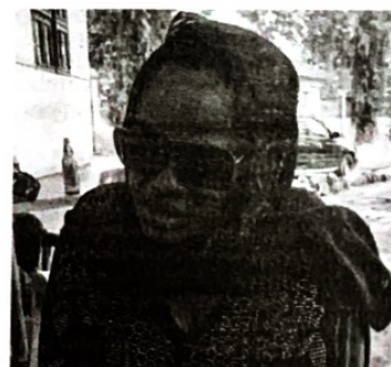
The grieving mother