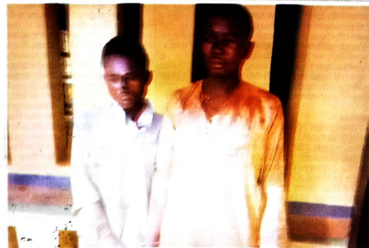
The suspected kidnapers

licemen couldn't go after them into the thick forest, it was the hunters who went after the kidnapers and rescued the victims and then handed them over to the police who later took the glory.