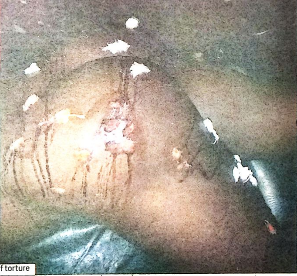
Victims of torture

policemen directed me to take Blessing to the hospital where she was treated.