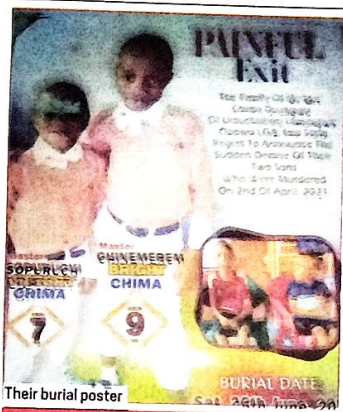
Their burial poster

NDUBUSI UGAH COORDINATOR nduby001@yahoo.com 08033617741