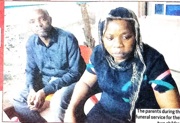
The parents during the funeral service for their two children