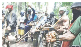
Niger: Bandits kill policeman, 14 others