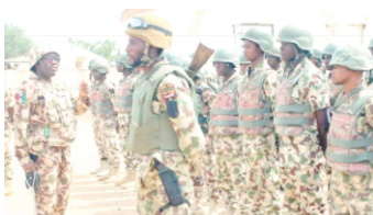
Insecurity: At least 15 bandits, one soldier killed in Niger