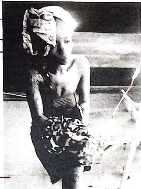
Some of the victims