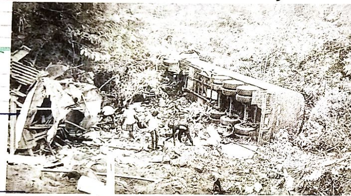
Scene of the accident

"We have sent signals to our operational offices that our men should be conscious of driver/people playing the highway. They should be mindful of the way they stop vehicles, possibly how they come in contact with the moving