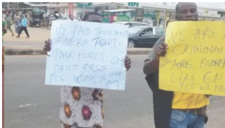
Commuters stranded as drivers protest task force, LASTMA extortion September 2, 2020 In "Metro & Crime"