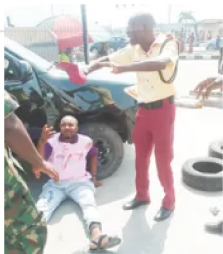
Lagos to prosecute man for breaking LASTMA official's head November 10, 2020 In "Metro & Crime"