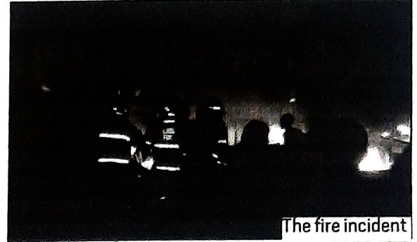
The fire incident

He added that on arrival at the scene, it was discovered that a section of the market selling spare parts was already engulfed by the inferno.