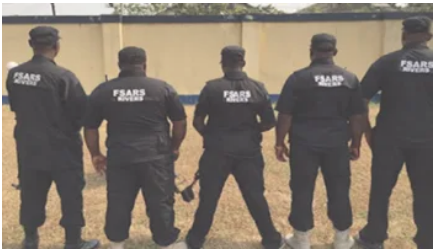
'SARS killed my husband, three labourers, tagged them robbers' December 8, 2020 In "Metro & Crime"