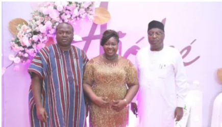
Glamour, glitz as dignitaries extol Ogunsan's wife on 40th birthday December 7, 2020 In "News"