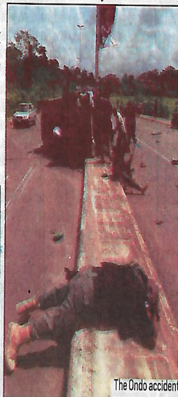
The Ondo accident