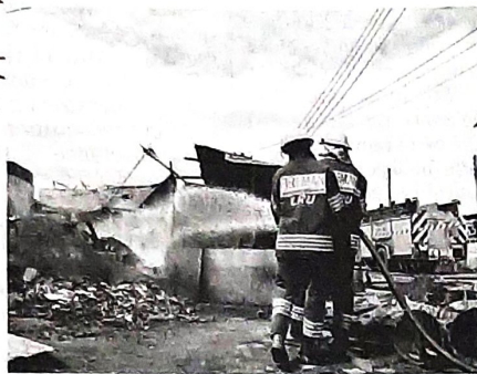
Fire fighters at the scene of the explosion