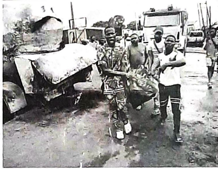
A body being carried out of the gas explosion.