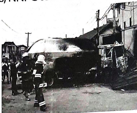
Another part of the explosion