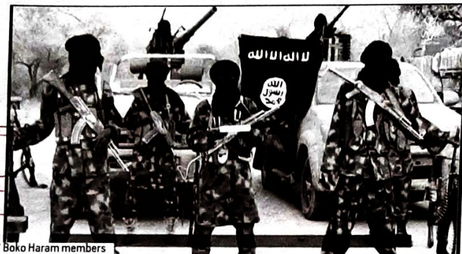
Boko Haram members

"Make no mistakes about this counter-insurgency war: those non-state actors are exploring their ter-