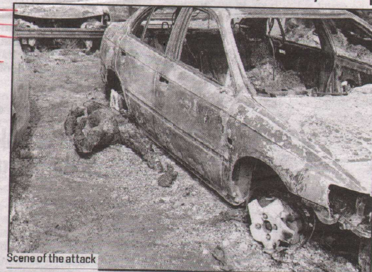
Scene of the attack

"I call on the general public to be law-abiding and not to take law into their hands. The government of President Muhammadu Buhari and the Borno State government will do anything possible to secure the lives