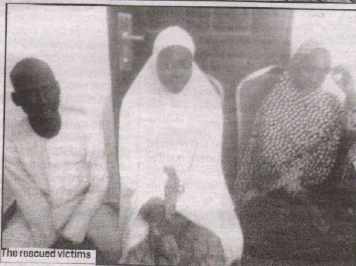
The rescued victims

some media reports saying that over 30 people were killed. This is false and not true. Yesterday (Sunday), we recovered three corpses and today (yesterday) we also recovered seven corpses. Insurgents did not attack the vehicles during the normal time of movement. They attacked in the night during the official closure time.