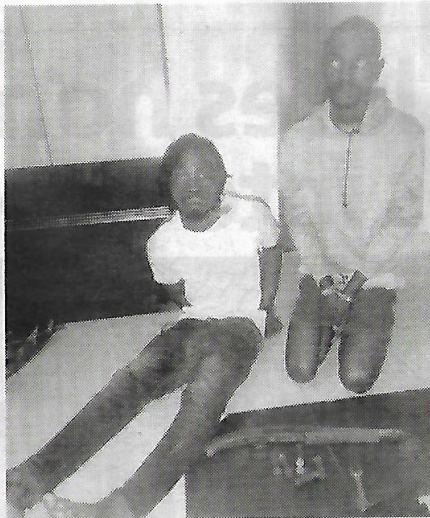
The two suspect

"Raymond collected the ransom and fled. They confirmed