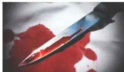
Warlords behead SS3 student in Ebonyi In "Metro and Crime"