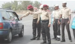
Accident: Oyo FRSC confirms death of personnel, another civilian in Ibadan In "Metro and Crime"