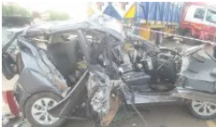
Auto crash claims 30 lives on Lagos-Ibadan Expressway In "News"