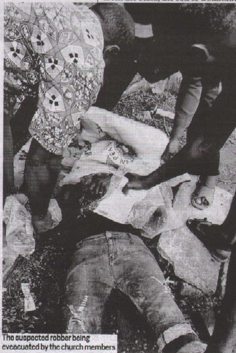
The suspected robber being evacuated by the church members

"A plumbing material shop, close to mine, had been robbed several times. Whenever they want to rob