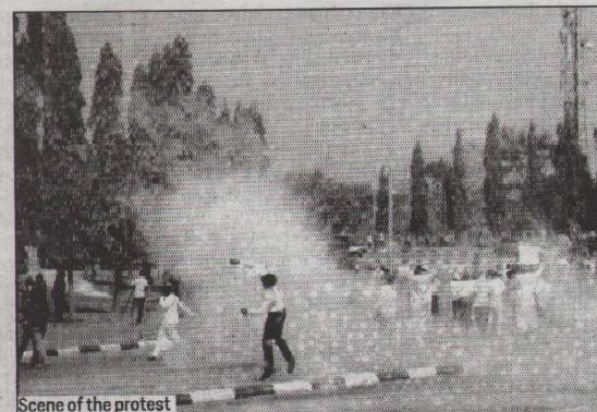
Scene of the protest