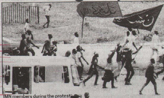
IMN members during the protest

El-Zakzaky and his wife have been in "protective custody" since