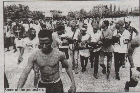
Some of the protesters

December 2015 despite court rulings ordering their release.