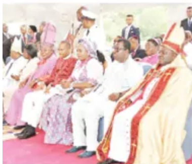
Church leaders before the collapse

Eye witness told Sunday Telegraph that while the event was ongoing (after the offering session), the church building's metal roof which is still under construction collapsed abruptly killing many of worshippers and bringing the event to an abrupt end.