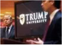
Trump delays business empire details