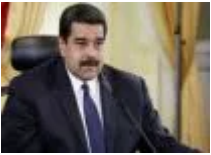
Venezuela closes border with Colombia