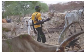
Sorrow, Tears And Blood As Fulani Herdsmen Invade Enugu Community