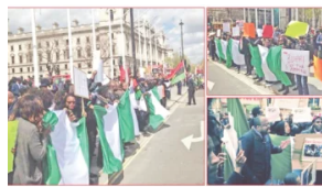
Buhari Orders Clampdown On Armed Fulani Herdsmen