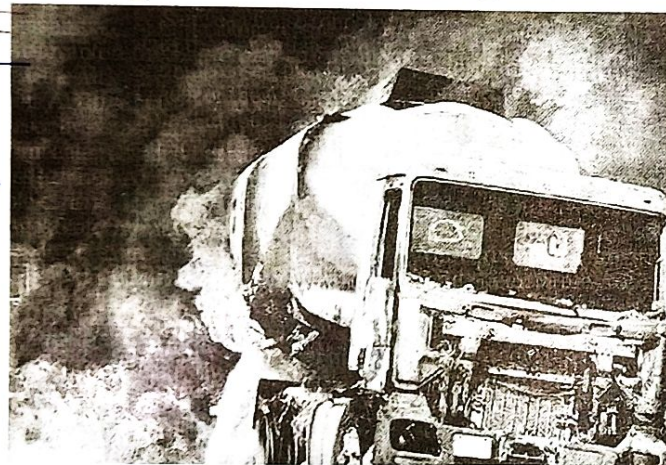
Scene of the explosion at Ogere