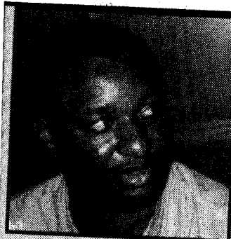
Keyamo: There was no conflict among the villagers

W e understand you have been briefed by the Afiesere community on the mayhem allegedly unleashed on the people by the police. What exactly are you up to?