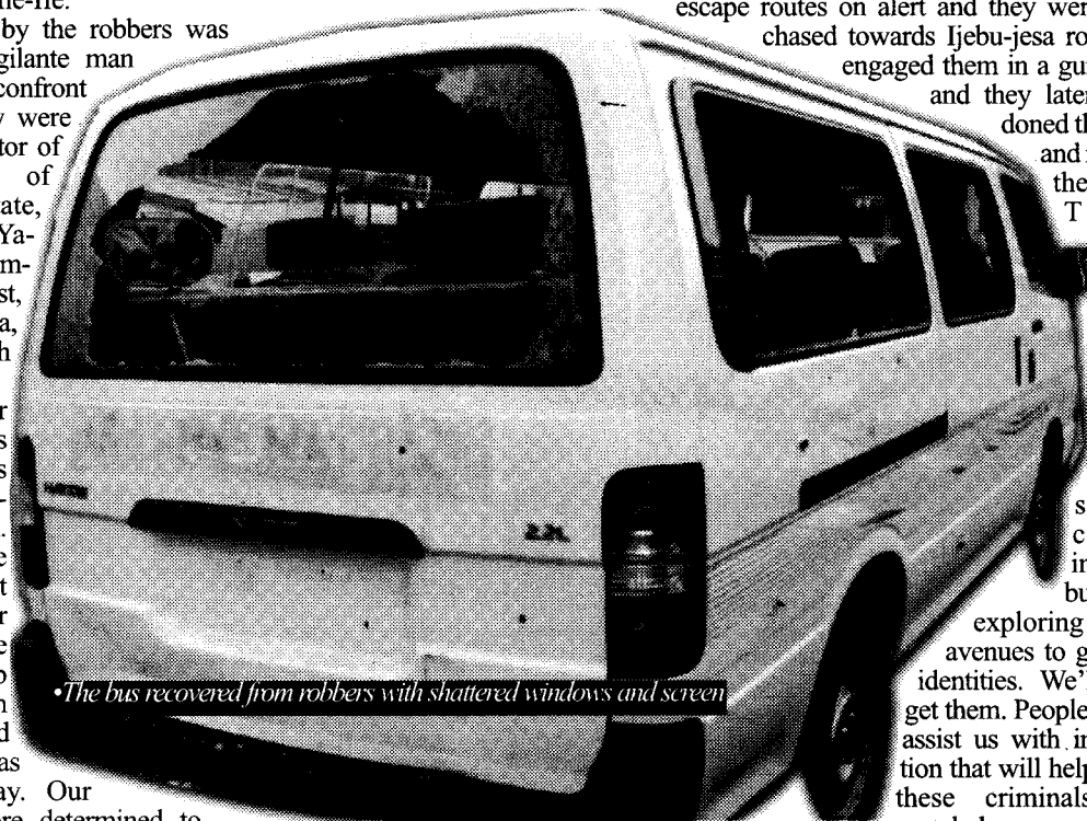
The bus recovered from robbers with shattered windows and screen