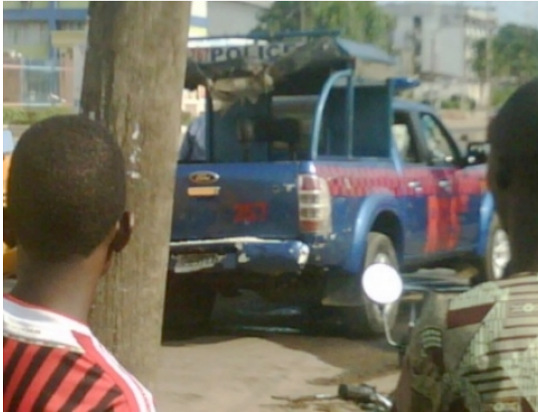
Rapid Response patrol vehicle attacked by armed robbers killing two policemen