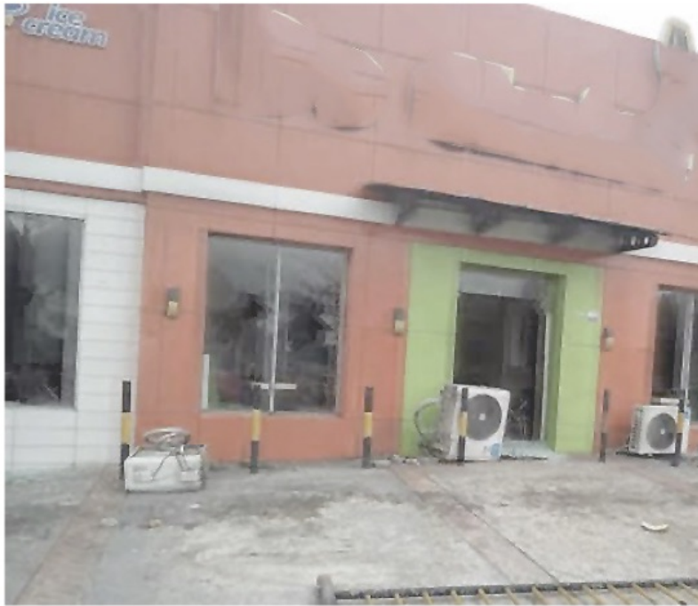
•The place where Mbakwe was killed