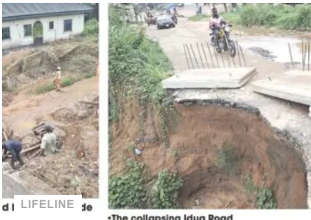
Trouble in Akwa Ibom as wicked flood ravages Eket 5th August 2022