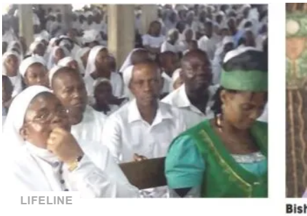
Aba Catholic parish celebrates first bishopric visit in style 5th August 2022