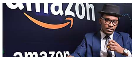
Nigerians: Get a 2nd Salary with Only ₦99000 Investment in Amazon Daily Finance | Sponsored