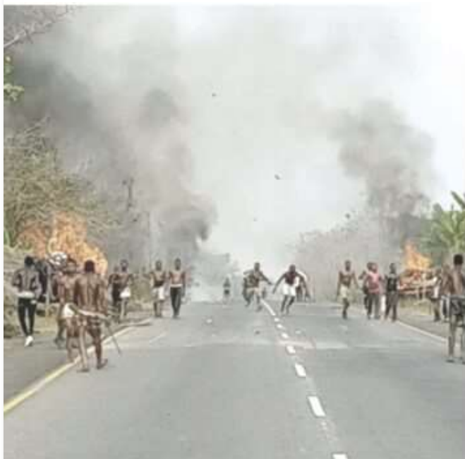
age warriors going for war