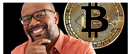
Nigerian Millionaire Reveals: How to Get Rich with Bitcoin, Without Buying Bitcoin Daily Finance | Sponsored