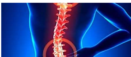
Tired Of Muscle And Joint Pain? Try This Flekosteel | Sponsored

“We call on youths who are often used as agents of social vices to desist from such act as the state government will severely deal with all culprits.”