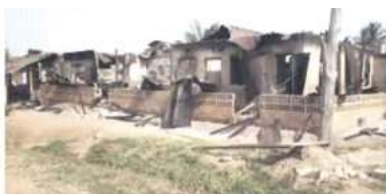
Some of the burnt houses

Ahead of the planting season in Cross River State, there has been renewed outbreak of communal clashes between border communities. More than 15 persons have been reportedly killed and over 3,000 persons rendered homeless.