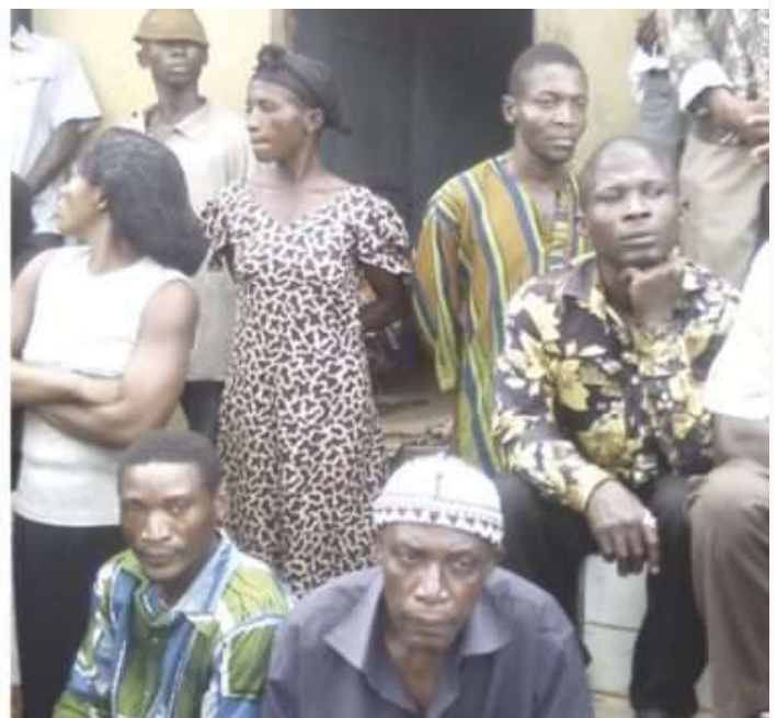
Survivors of a communal clash