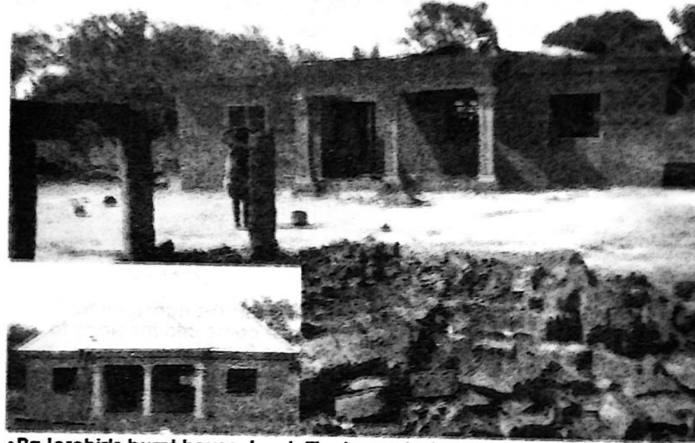
• Pa Iorchir's burnt house. Inset: The house before it was burnt down

Aondo is just one of the over 5,000 victims of the lingering crisis between the two warring communities of Gwer East LGA, which, according to sources, started between Tse-Nor