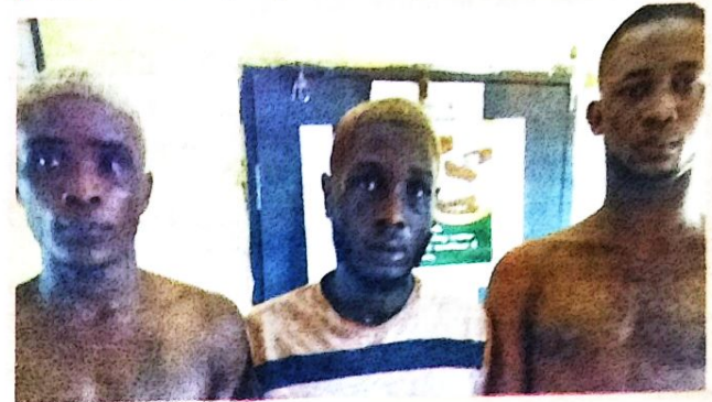
SOME OF THE SUSPECTS