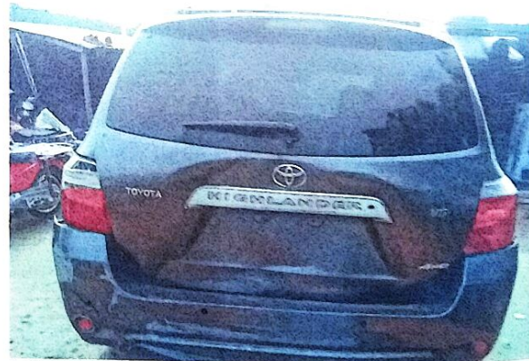
A RECOVERED VEHICLE