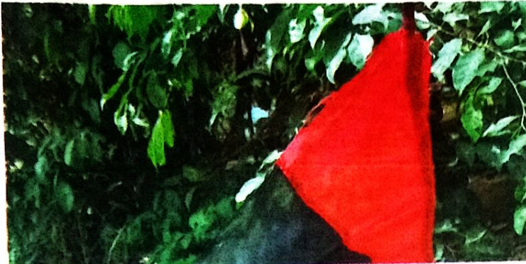
FOREST USED BY THE SUSPECTS

The criminals stormed Omuma with over 20 gang members and burnt down the police patrol vehicle and killed the policeman. They drove the police patrol to the Omuma Police Station and killed the DPO and another officer. We have been in bondage for over a year that they have been terrorizing us. They killed some of our youth, burnt our houses and stolen our property.