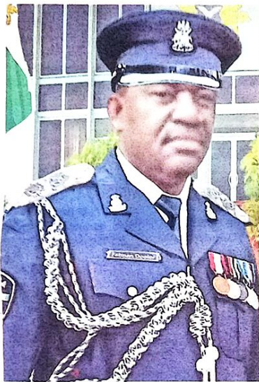
THE SLAIN DPO, DOOIOR

"The suspects confessed to be acting under the command of Commander Temple, Commander Ezekadele, Commander Ebube Virus and stated that the leader of IPOB/