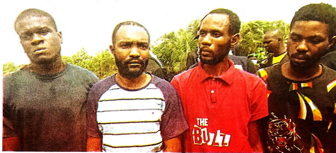
Suspects in connection with murder of hotel guest

Toritseju was said to have returned to Nigeria on January 23 after graduating