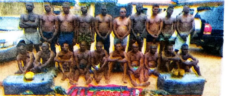
Suspects arrested at Okporo after an attack at the police post.

group is behind the beheading and attacks on police stations, the Biafran has declared war on any gunmen caught engaging in such act. This