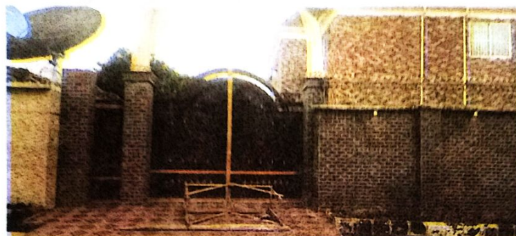
•House where the shooting took place