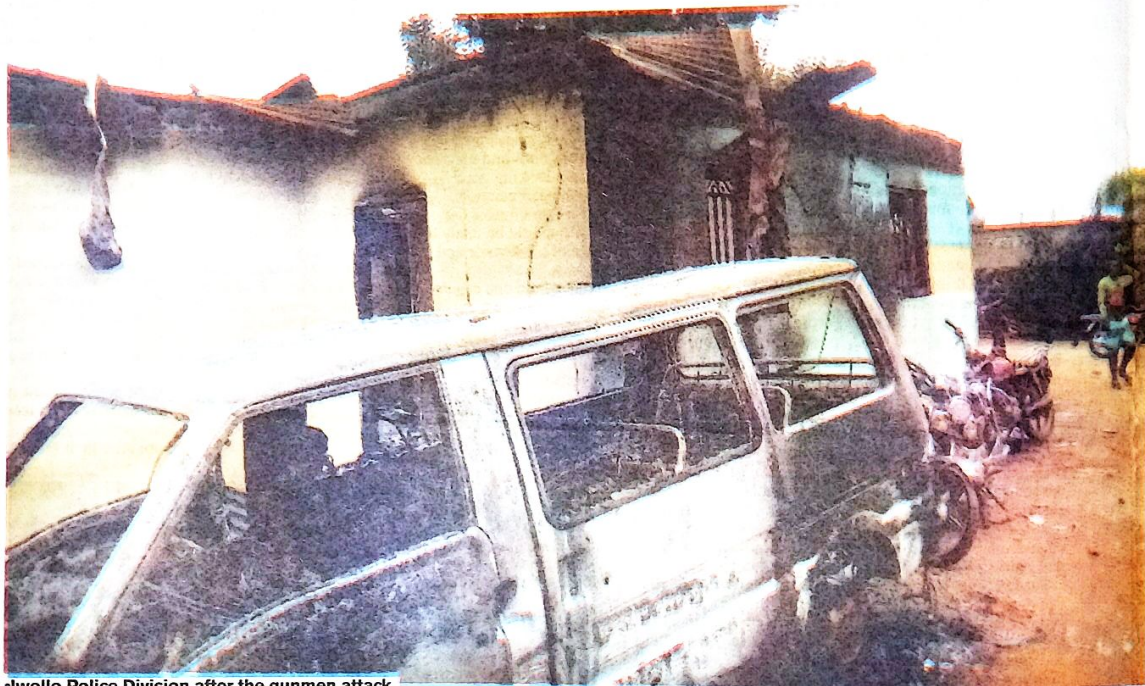
•Iwollo Police Division after the gunmen attack.

In fact, the matter seemingly got to a head recently as President Muhammadu Buhari took to his Twitter handle to send a stern warning to those, he said, were bent on dismembering Nigeria, threatening to deal ruthlessly with the people of Southeast in the his widely criticized tweet.