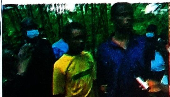
•Suspects ("Kill and bury and Prophet Nkpe) leading security men, journalists and others to where 3 victims were buried.