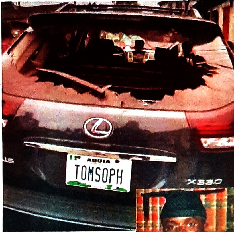
•An SUV's glass smashed in Diobu by cultists.