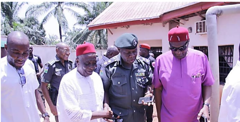
Tension in Enugu as Ohanaeze President General's Ukehe home bombed Tension in...

The military authority in the state has not issued any reaction on the incident as at press time. The Dalori camp is about 2 kilometres to the business district.