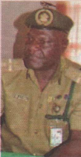
THE LATE RTD. PRISON CONTROLLER