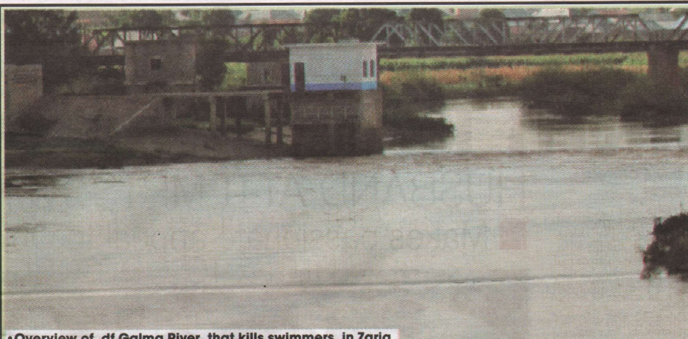
• Overview of Galma River that kills swimmers in Zaria