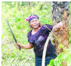
How Enugwu-Ukwu women revive age-long practice