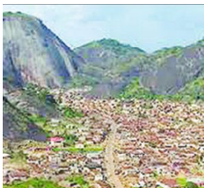
Akre: City Swallowed By Rocks