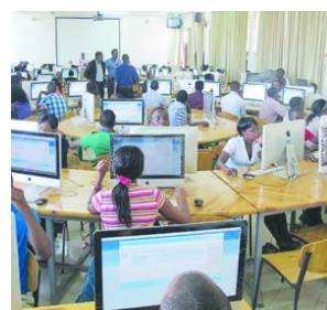
How teachers can integrate technology in classrooms –